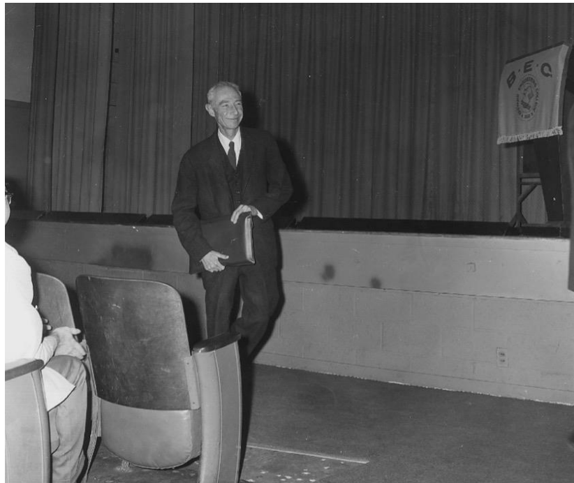
J. Robert Oppenheimer at Brevard Engineering College Science Seminar

Earlier, Bohr had written to Roosevelt expressing his concerns. If the Soviets were forewarned of the bomb "in an aura of friendliness," Bohr thought this "responsible action" might save the world from nuclear Armageddon. Oppenheimer told the BEC students and faculty that Bohr's action "was a noble failure."