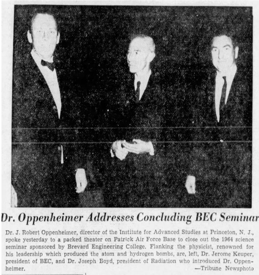
The Cocoa Evening Tribune, Jan. 20, 1965

In a “tremulous yet resolute” voice, the “father of the atomic bomb” spoke about the “miserable things,” his euphemism for the atomic and hydrogen bombs. A decade earlier, the Atomic Energy Commission (AEC) had stripped Oppenheimer of his security clearance. Eleven years had done little to assuage the pain caused by this assault on his loyalty.