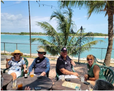
Square Grouper Tiki Bar