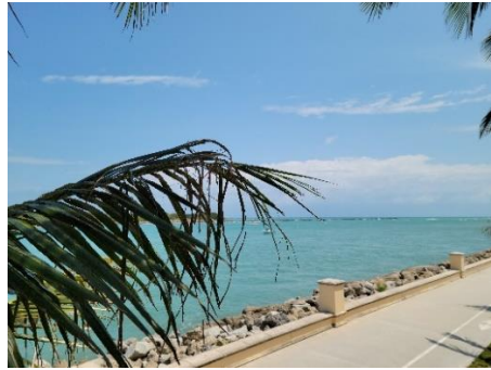
View from the restaurant!