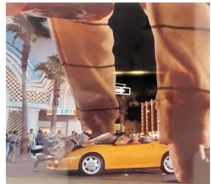
'Baby standing over car'

This car was used in the Disney/MGM movie: "Honey, I Blew Up the Kid"