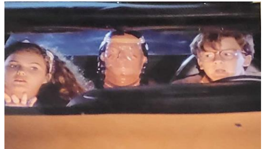
'Kids with Indian'