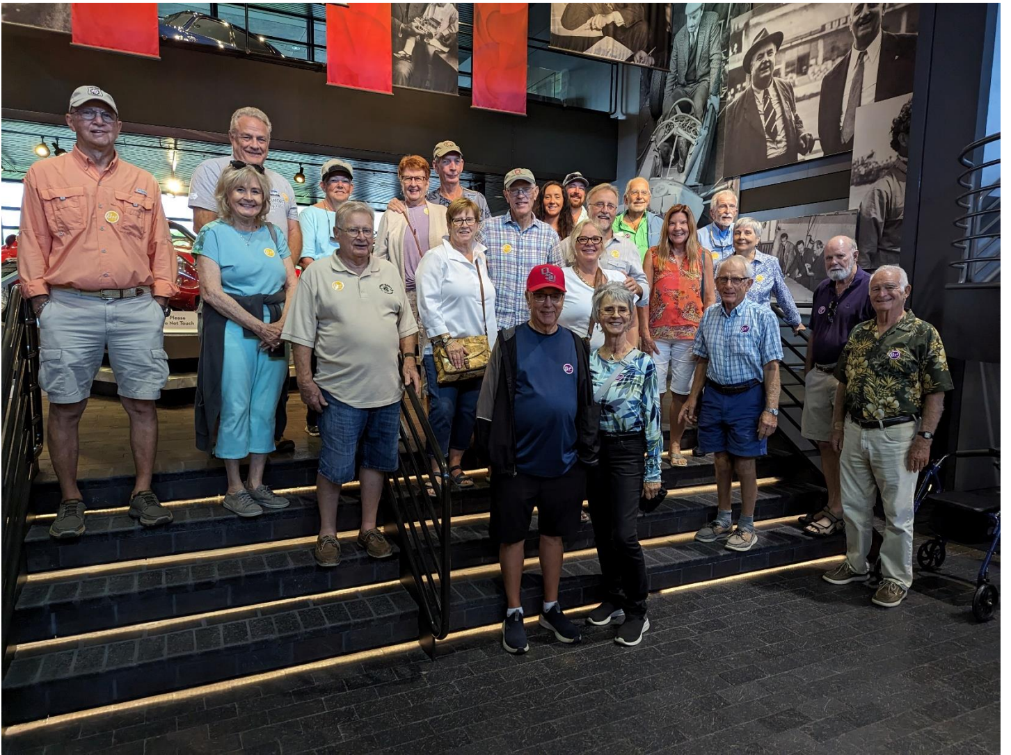
Group Photo courtesy of Revs Institute (Anna)