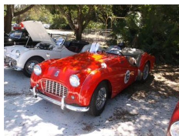
'57 Triumph TR3