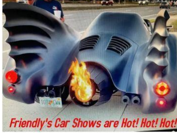
Friendly's Car Shows are Hot! Hot! Hot!

Free Show, Bring what ya got. Everyone Welcome.. Rat Rods. Under Construction, All Years, Makes & Models are Welcome, No Judging, No Trophies, Just Good Fun!!