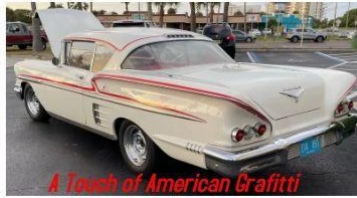
A Touch of American Grafitti