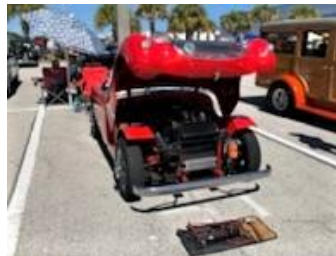
1960 Austin Healey