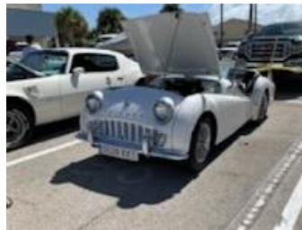
1955 Triumph (Mike)