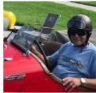
Made with PosterMyWall.com

Remember: Friendly's Breakfast Special Mon-Fri 8:00 AM - 11:00 AM Only $5.99