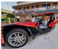
Made with PosterMyWall.com

Remember: Friendly's Breakfast Special Mon-Fri 8:00 AM - 11:00 AM Only $5.99