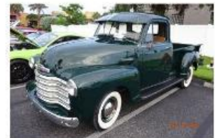
Made with PosterMyWall.com