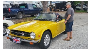
Forbes (Cody) Anderson's TR6