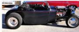
Sponsored by Walmart Indian Harbor Beach

Remember: Friendly's Breakfast Special Mon-Fri 8:00 AM - 11:00 AM Only $5.99