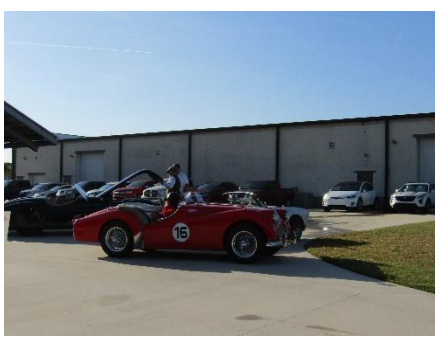
LBC needed some TLC