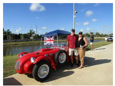
Jim's Daughter & Son-in-law