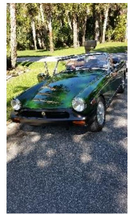
Paul's MG Midget